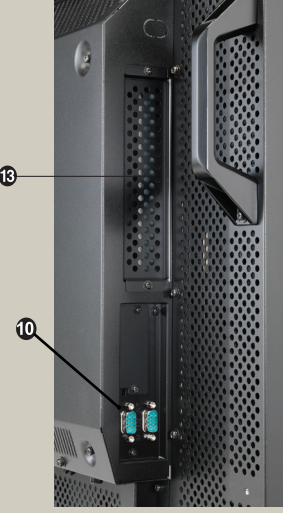
MultiSync Large-Screen LCDs feature a number of input connectors for maximum compatibility. This makes it possible to upgrade adapters or software without having to purchase a new display.